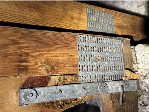
Roof to wall attachment - Clips