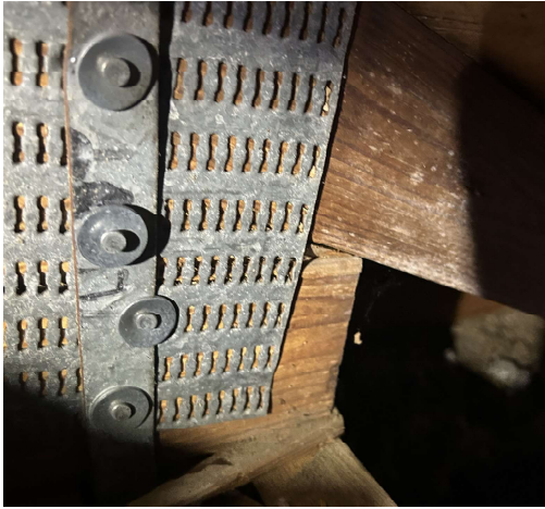
Roof to wall attachment - Clips