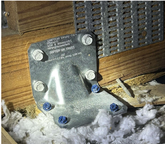
Roof to wall attachment - Clips