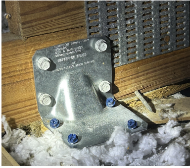
Roof to Wall - Clips