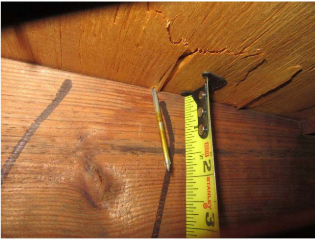
Roof Deck Attachment - 8d Nails