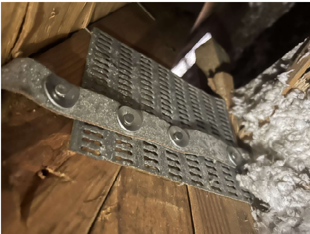
Roof to wall attachment - Clips