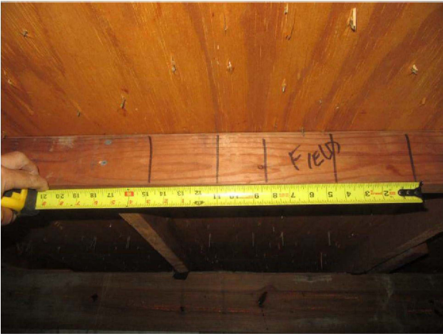
Roof Deck Nail Spacing - Field