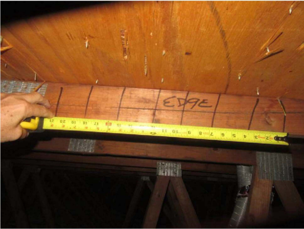
Roof Deck Nail Spacing - Edge